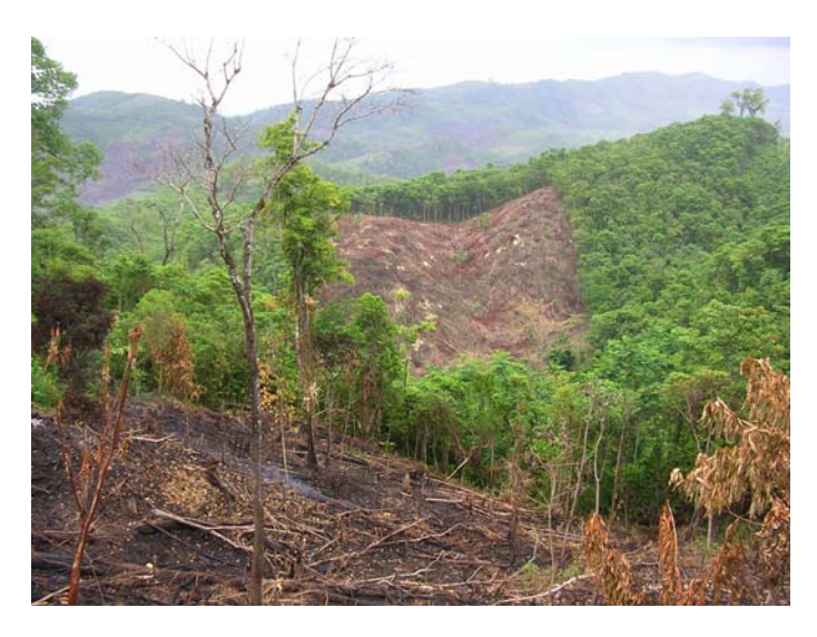
Fig. 1 A recent (May 2006) example of "slash and burn" clearing of rainforest at a site near the eastern boundary of Palenque National Park, Chiapas, Mexico. With continued clearing, the park itself becomes more and more isolated from Selva Lacandona, a vast swath of rainforest to the south