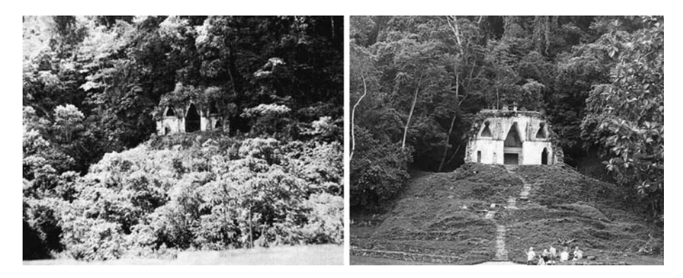
Fig. 2 Clearing of rainforest within Palenque National Park, Chiapas, Mexico, here around the Temple of the Foliated Cross, as seen in 1949 ( left ; from Goodnight and Goodnight 1956, © Ecological Society of America, reproduced with permission) and in 2006 ( right )